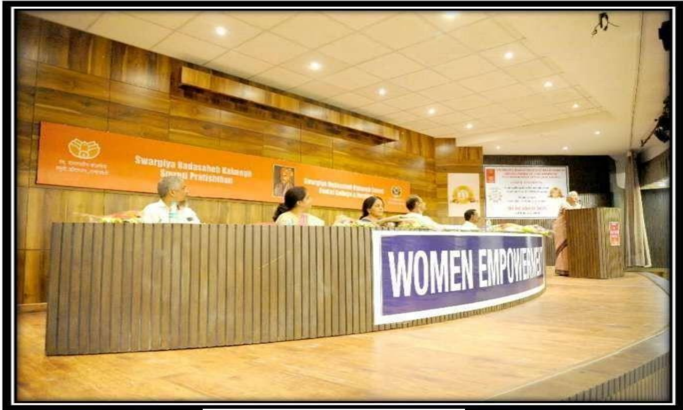
Guest lecture by the Guest Speaker