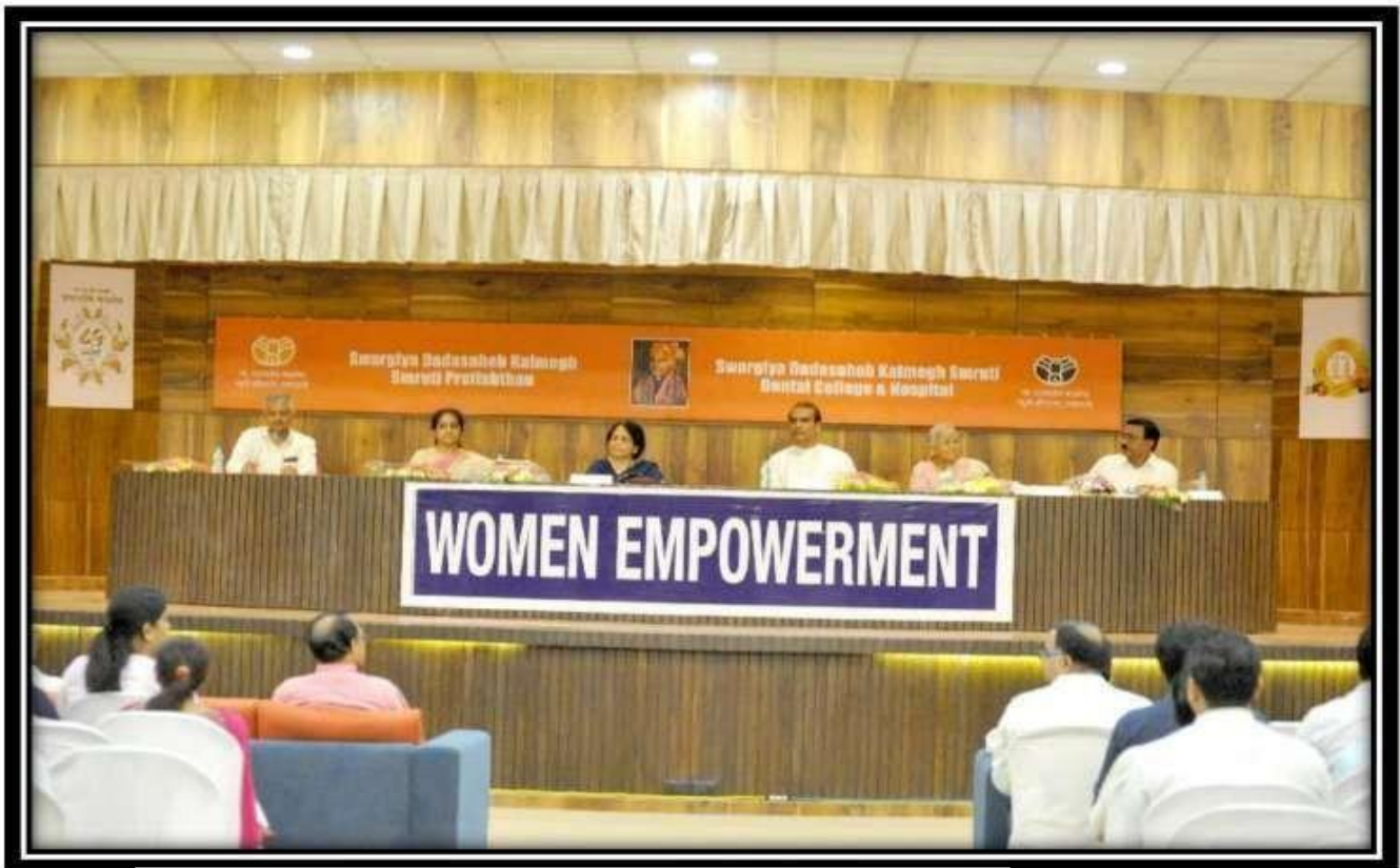
Guests in Auditorium during Women Empowerment Program